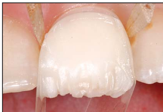
Figure 5. The enamel microfill composite is placed with a plastic instrument and shaped with a composite roller after the flowable composite.

The first composite resin layer (ie, Renamel Universal Hybrid, Cosmedent, Chicago, IL) formed the foundation of color within the restoration (Figure 4). Shade A3 was placed in the formerly decayed interproximal areas and on the incisal edges where length was to be added. It was undercontoured by 1 mm in all areas so that the layer would not extend through the final enamel layer