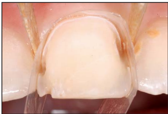
Figure 3. Decay, composite, and surface stains are removed, and the entire surface is roughened with a diamond bur. A contour matrix is placed and very lightly wedged.