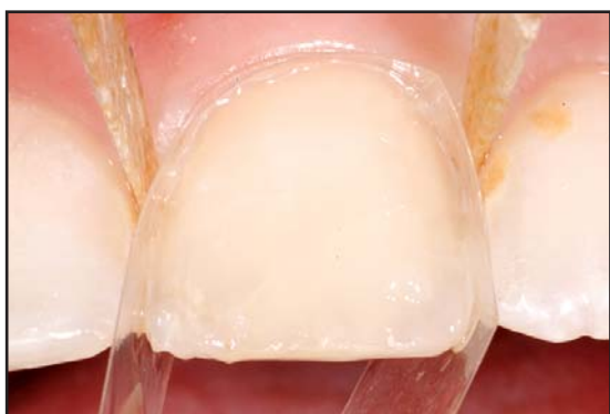
Figure 4. The areas of missing tooth structure interproximally and incisally are replaced with a microhybrid matching the existing dentin shade.