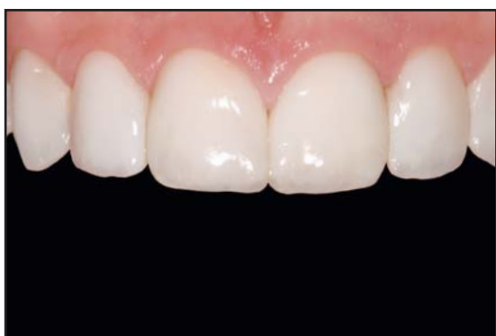
Figure 15. After three weeks, final images are taken that are consistent with the preoperative views.